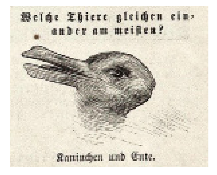
Figure 1: The rabbit–duck illusion, anonymous illustration from the Fliegende Blätter (Flying Pages). 23 October 1892. Pg 147. Caption reads: "Welche Thiere gleichen einander am meisten? Kaninchen und Ente" ("Which animals are most like each other? Rabbit and Duck.").

"Architecture allows us to intervene in and open up latent questions that linger across different disciplines. Our understanding of architecture or of research in architecture is therefore not connected to a design proposal in the way that conventional research in architecture is undertaken, where in order to facilitate better intervention on a site, architects study it, its context, and then establish the conditions for design to take place."<sup>2</sup>