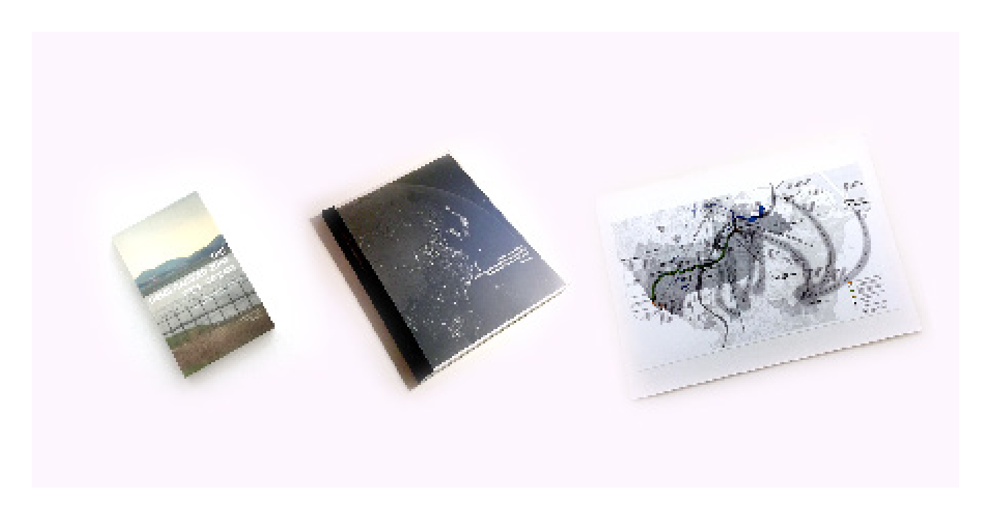
Figure 4: Interpreting the present through research. Research materials produced by the author. October 2018, Photo by author.

available full text of the agreement, mainly due to its large size, and security related reasons. However, the "Armistice Agreement Volume II-Maps" is freely available online from the US National Archives and Records Administration now.<sup>11</sup> The Armistice Agreement Volume II-Maps contains nine maps at 1:50,000 scale. They clearly illustrate and demarcate the DMZ through its "Military Demarcation Line" at the center of the DMZ; the "Northern Boundary" of the DMZ, and the "Southern Boundary" lines of the DMZ. The agreement's text and the maps combined become raw ingredients, an authoritative primary source that precisely describe and illustrate the DMZ's historical formation. They also narrate how the vast, highly militarized, fortified DMZ—a specific spatial condition-emerged from a mere thin black line inscribed over on an often-reductive map that abstract complex human inhabitation and ecological processes