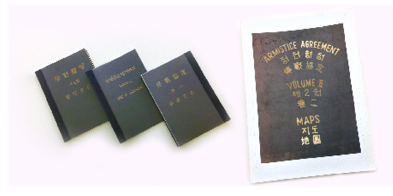
Figure 3: Understanding the past though primary sources. Replica of "Armistice Agreement Volume I-Text and Volume II-Maps." October 2018, Photo by author.

stakeholders of the Demilitarized Zone (DMZ) to creatively reimagine its alternative futures. This further equips architects to explore the productive potentials latent in the heavily militarized 155-mile-long, 2.5-mile-wide border zone that has bisected the Korean Peninsula since 1954. The portmanteau consists of three main parts. These three parts elucidate how the two opposing Koreas together constructed the DMZ, how we can interpret its conditions, and how we can envision its future transformations. These distinct individual parts imply the past; the present; and the future of the DMZ. Furthermore, when these three components are combined, they reveal dynamic change inherent within border zones. More importantly, it highlights architects' agency in understanding, interpreting, and shaping the DMZ's productive future that starts to question established concepts of nation-states and their borders.