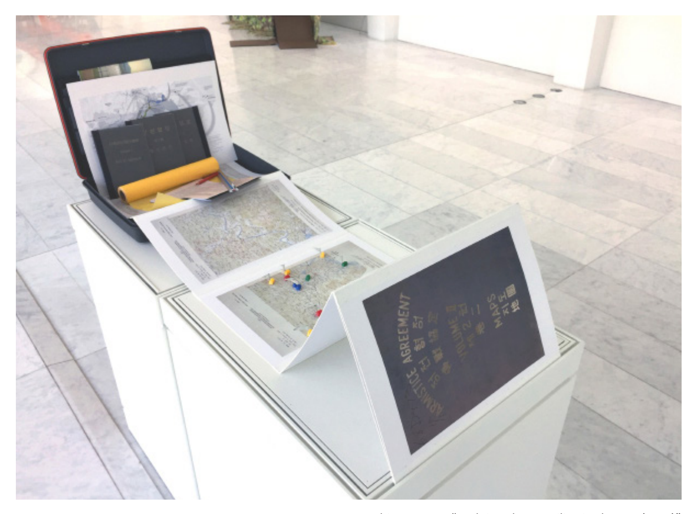
Figure 2: "Undoing the Demilitarized Zone (DMZ): The Agency of Architectural Intelligence" portmanteau installation at the ASCA Fall Conference, Milwaukee, MI. October 2018